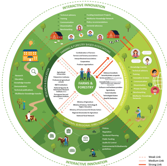
Figure 1: Portuguese AKIS diagram

Further support for the AKIS structure is anticipated under the CAP Strategic Plan, which plans to leverage other financial resources, including the Cohesion Policy Funds, Horizon Europe, and the Recovery and Resilience Plan (RRP). These instruments are intended to bolster the research, development, and training sectors aligned with national regulatory frameworks, thereby enhancing Portugal's capacity for agricultural innovation and education